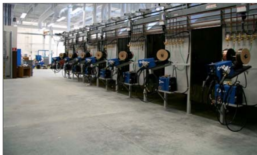
KPU's welding booths use an integrated system that shuts off both the lighting and exhaust fans when not in use.